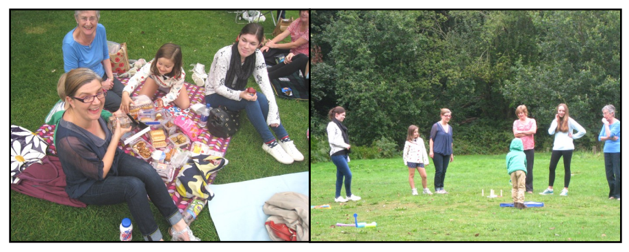
Memories of a previous Parish Picnic

If the weather is bad, we will retreat to the Church Hall.