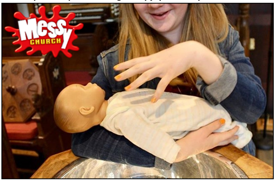
And there was a chance to do our own 'pretend' baptisms.