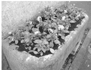
The old water trough near Lexden Church