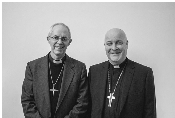
Archbishop of York designate, Bishop Stephen, with The Most Reverend Justin Welby, the Archbishop of Canterbury.

"The Right Reverend Stephen Cottrell, Bishop of Chelmsford, has been nominated by Her Majesty the Queen as the new Archbishop of York in succession to the Most Reverend and Right Honourable Dr John Sentamu."