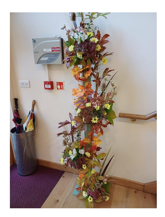
What a talented lot you all are!